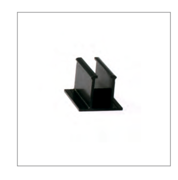
U type mounting bracket