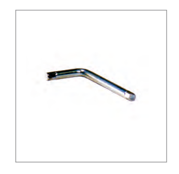
M4 Allen Key